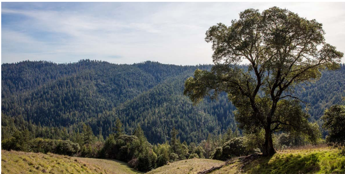
Atkins Place is a 453-acre coast redwood property in Mendocino County, California.

Nonprofit seeks to raise $1.3 million for the purchase of Atkins Place to expand Montgomery Woods State Natural Reserve