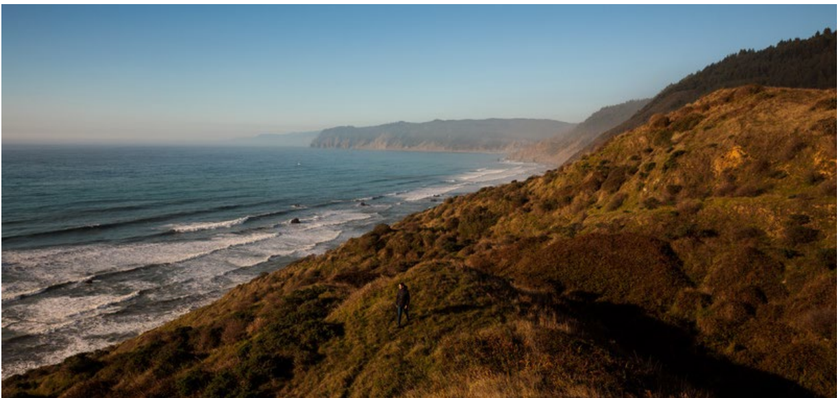
The Lost Coast Redwoods property spans 5 miles of California coastline near Rockport, California.

Potential for future public access along the famed Lost Coast