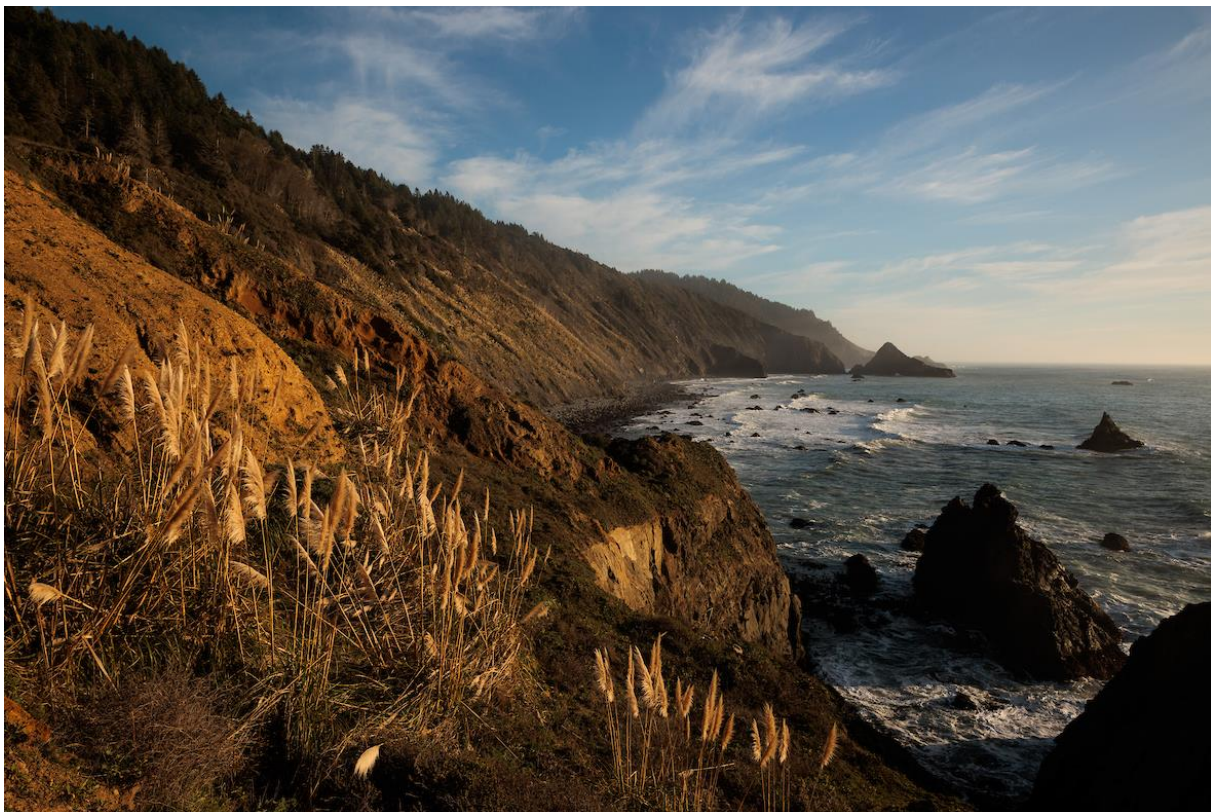
The Lost Coast Redwoods property near Rockport, California.

Potential for future public access along the famed Lost Coast