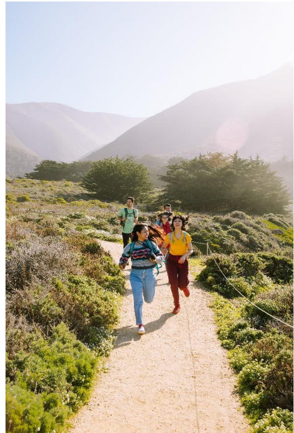
Garrapata State Park.