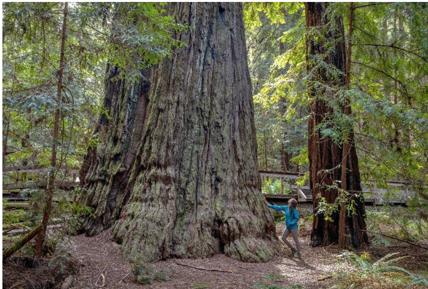
Montgomery Woods State Natural Reserve.

Through special community events and in-person and virtual programming, this week-long event celebrates California’s 280 state parks and the people who visit and help protect these iconic places. A complete list of the week’s events and how to participate are available at CAStateParksWeek.org .