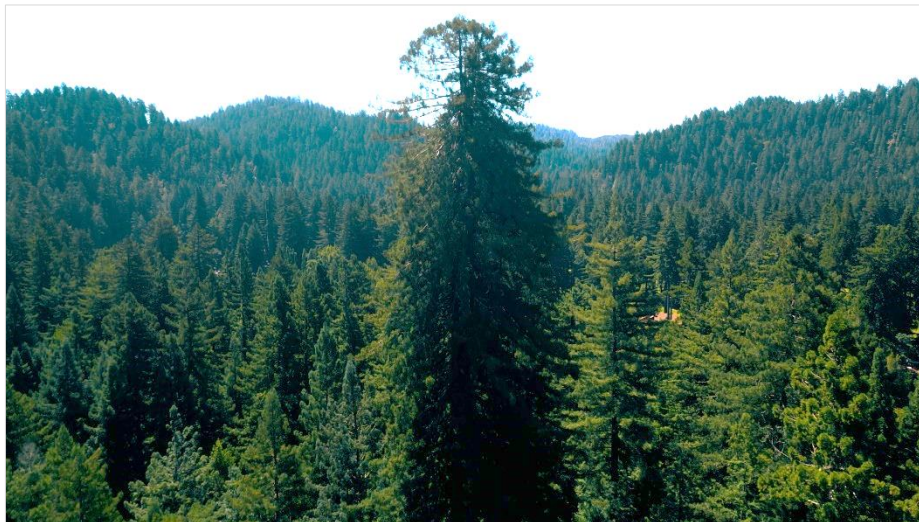
The Clar Tree rises through the canopy on the 394-acre Russian River Redwoods property.

San Francisco, Calif. (August 1, 2023) – Save the Redwoods League today announced that it has secured an agreement with RMB Revocable Family Trust to acquire a 394-acre redwood forest in Sonoma County, named Russian River Redwoods . The deal will ensure long-term protection for the Clar Tree, one of the county's oldest and tallest coast redwoods, and 1 mile of Russian River frontage near Guerneville. The League is seeking to raise $6.5 million for acquisition and project costs to purchase and temporarily hold the property by September 30, 2023.