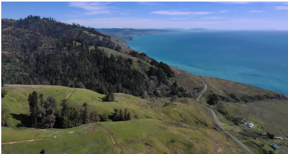
Sonoma Coast Redwoods.

Nonprofit seeks to raise $16 million by December 31 to acquire and restore mature second-growth redwoods in Sonoma County