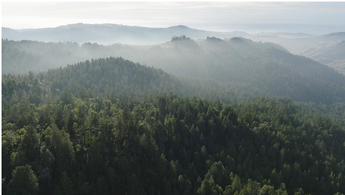
The 1,517-acre Monte Rio Redwoods Expansion property in Sonoma County.

Monte Rio Redwoods Expansion offers connectivity for habitat conservation and future expanded public access to Monte Rio Redwoods Regional Park and Open Space Preserve