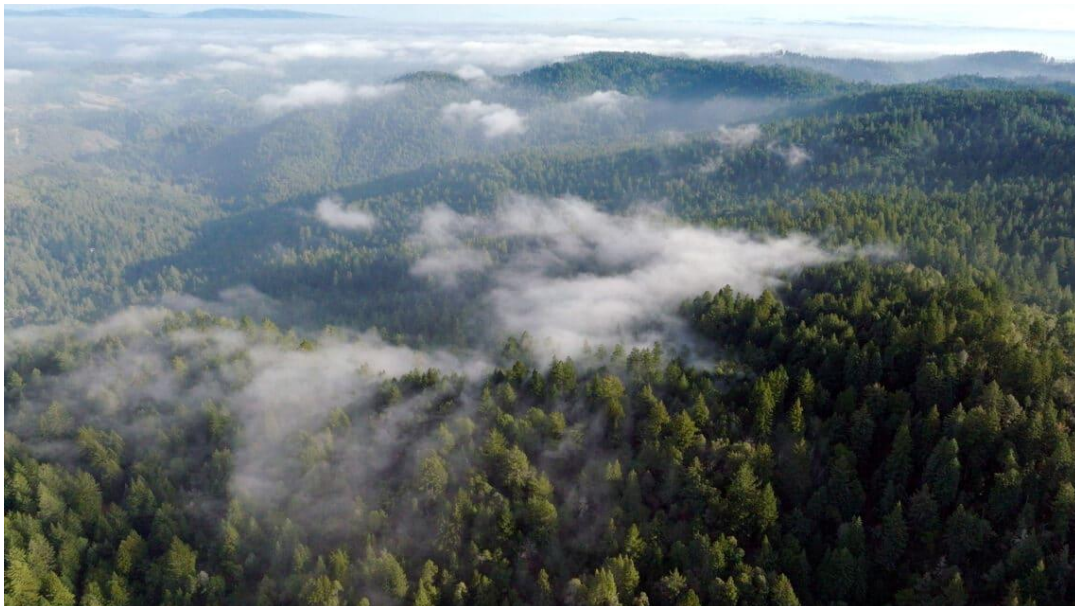
The 1,517-acre Monte Rio Redwoods Expansion property in Sonoma County.

Sonoma County Ag + Open Space District Holds Conservation Easement and Recreation Covenant for Further Forest Protection and Recreation