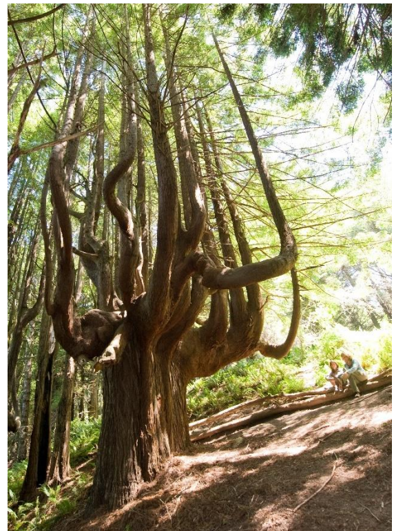
A candelabra tree at Shady Dell.

With the dry brush and strong winds, the fire spread quickly onto Shady Dell and burned the bluffs the following day. CAL FIRE responded quickly, sending out fire trucks, helicopters and aerial support. The crews were able to hold the fire on the south side of Shady Dell at the established fuel breaks on the ridgeline of the property. The old-growth coast redwoods, candelabra grove as well as other sensitive sites were not burned.